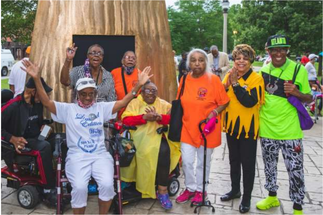
CHA participated in a celebration unveiling a monument honoring journalist, educator and activist Ida B. Wells near Oakwood Shores in June.