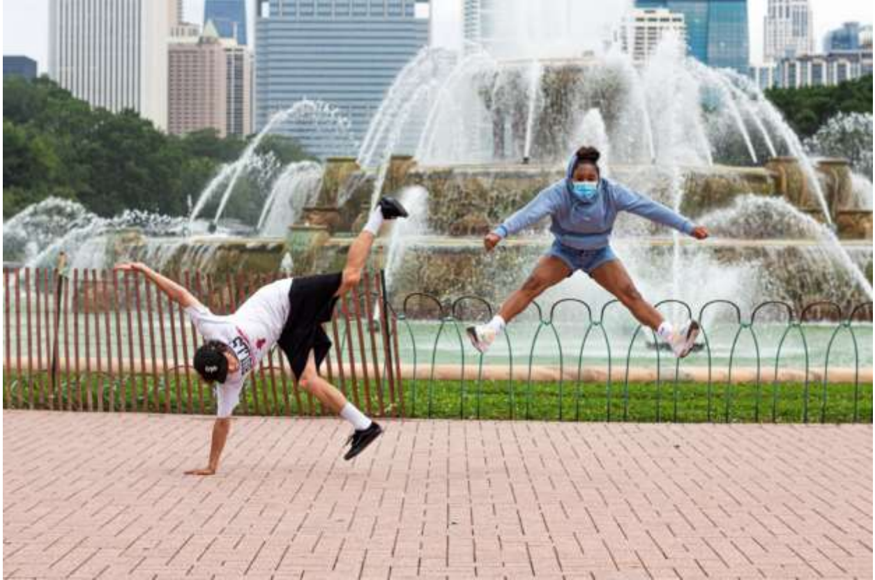
Youth in DePaul's Next Level Photography summer program practice their outdoor photography skills in downtown Chicago.